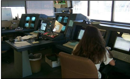
Centralized Loading Office

Centralized loading control allows one or more operators to manage the entire process for multiple loading facilities at the same time. With video monitoring, control may be located across the plant site from the loading facility, or even in another city.