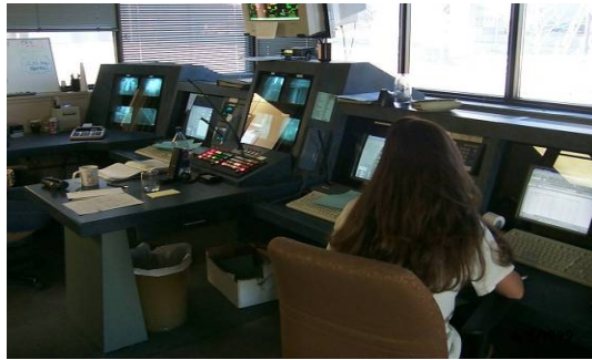
Centralized Loading Office

Centralized loading control allows one or more operators to manage the entire process for multiple loading facilities at the same time. With video monitoring, control may be located across the plant site from the loading facility, or even in another city.