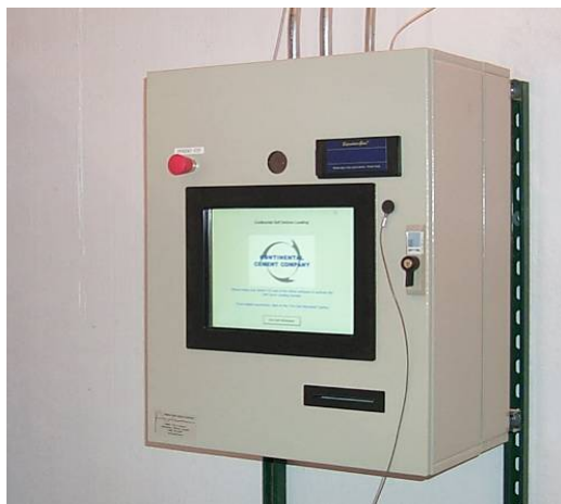
Self - Service Loading Kiosk

To load a truck, the driver follows color-coded instructions on a touch screen, and can complete the entire loading process with as few as five commands. An electronic signature pad captures the driver's signature and prints the required number of Bills of Lading automatically.