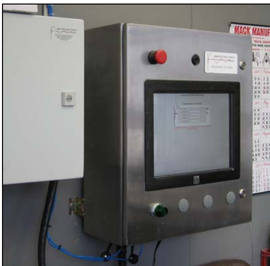
Self - Service Loading Kiosk

To load a truck, the driver follows color-coded instructions on a touch screen, and can complete the entire loading process with as few as five commands. An electronic signature pad captures the driver's signature and prints the required number of Bills of Lading automatically.